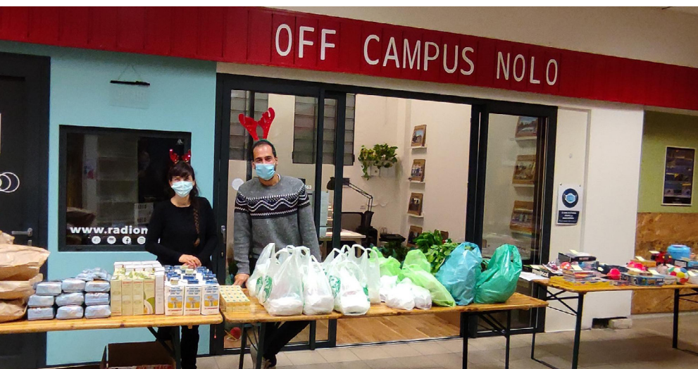
04. Volunteers during the preparation of food boxes, 2020