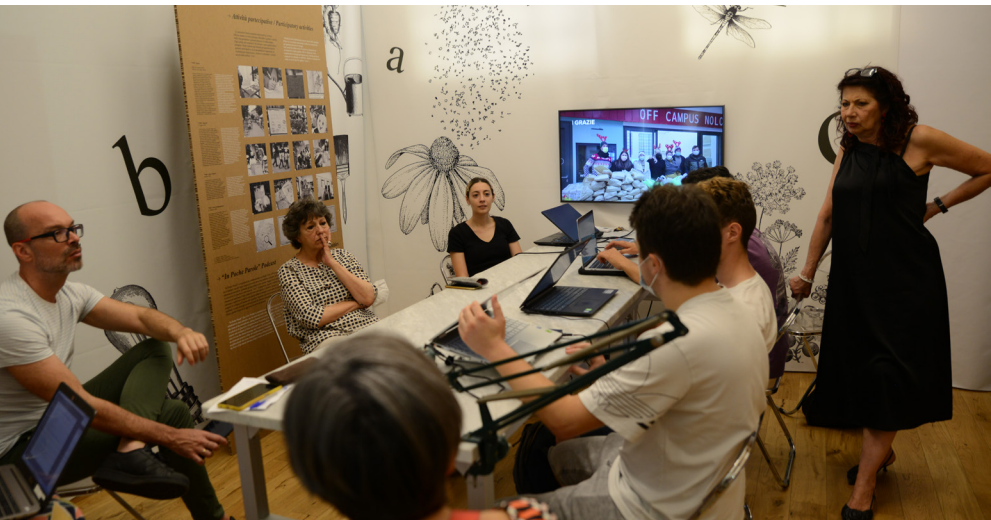
06. Volunteers co-design session, Off Campus Nolo 2022

The research and experience of the departments then made it possible to formulate a feasible model for the service prototyping.