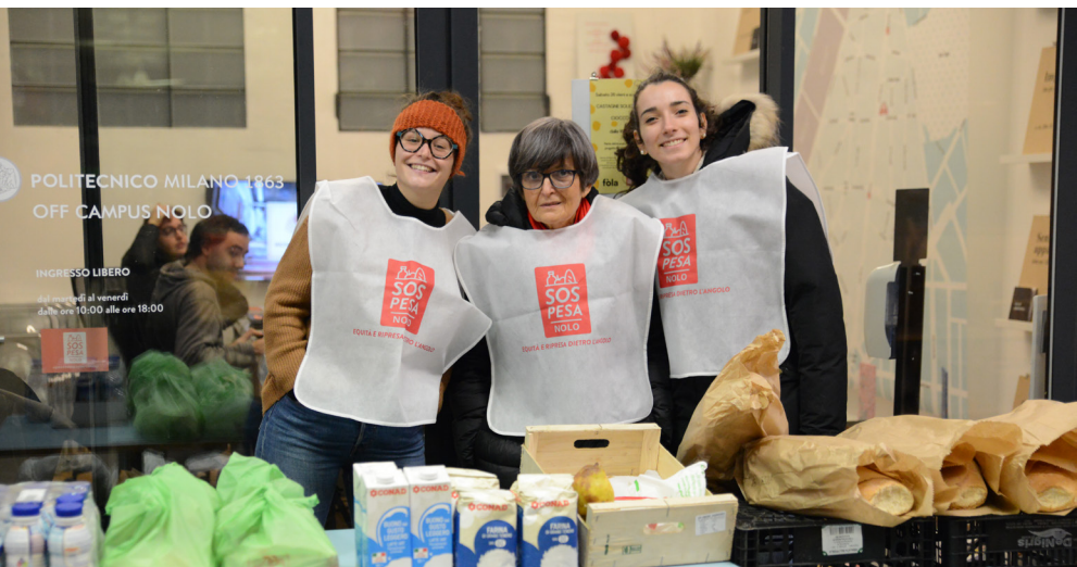
16. Volunteers during the distribution of grocery boxes.

A co-design meeting (16) was organised with the volunteers to collaboratively build the activity schedule and to begin assigning roles for weekly tasks, encouraging active participation and shared responsibility for the back-office operations that enable SOSpesa to run every Friday.