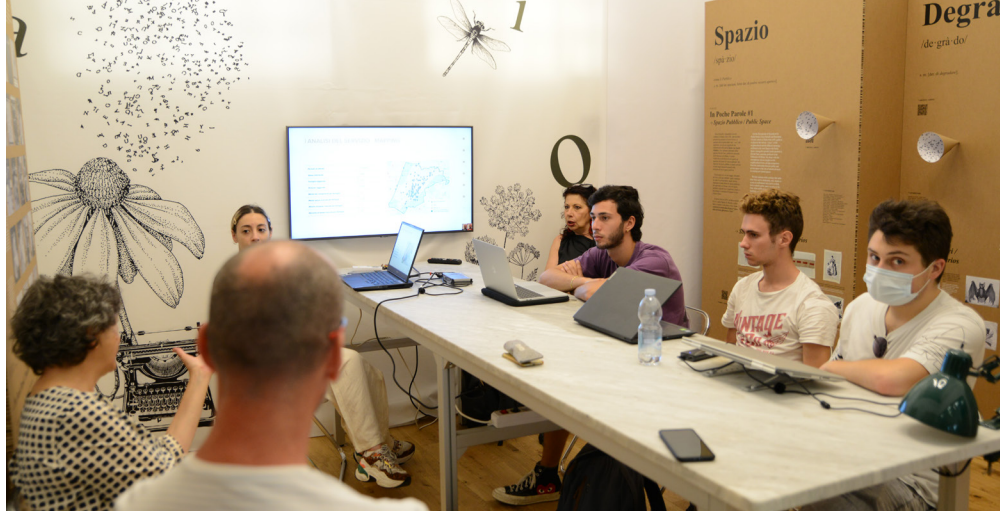
07. Volunteers co-design session, Off Campus Nolo 2022