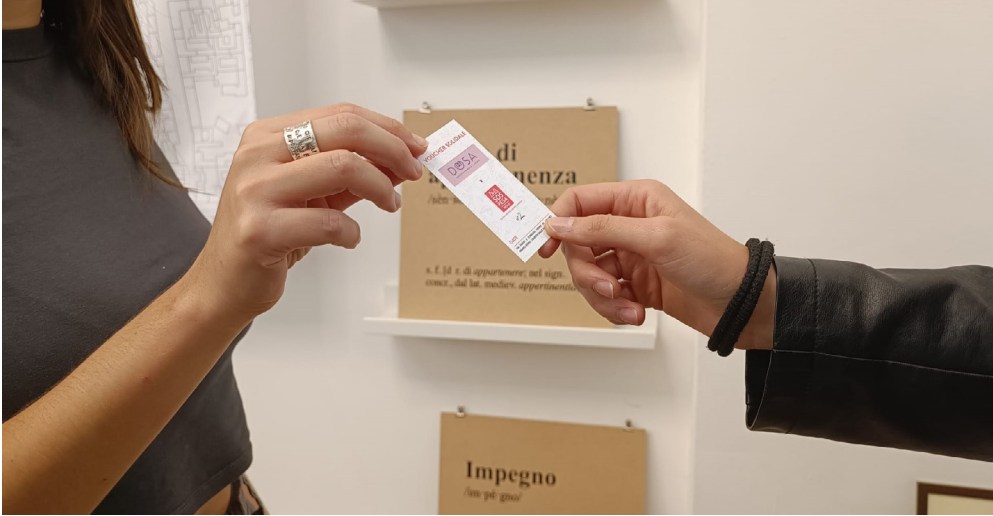
15. Voucher solidale per il ritiro da DO.SA.

As highlighted during interviews in the first phase, neighbourhood shops do not generate significant surplus. Even when excess products are available, they are not predictable in advance.