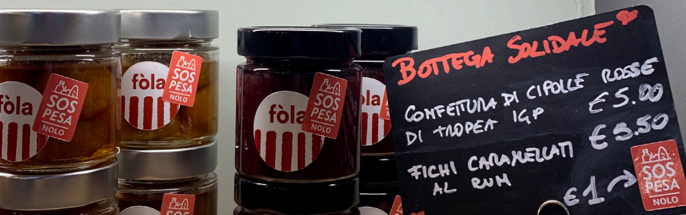
09. Jam produced by Fòla using recovered fruit and vegetables, labelled with the SOSpesa sticker.

During the trial period, it was observed that the unpredictable quantities of produce recovered from the Ortomercato often resulted in an excess of fruit or vegetables, which could not always be distributed solely to families. As a response, the activation of a transformation and sales process was identified as a way to prevent further waste.