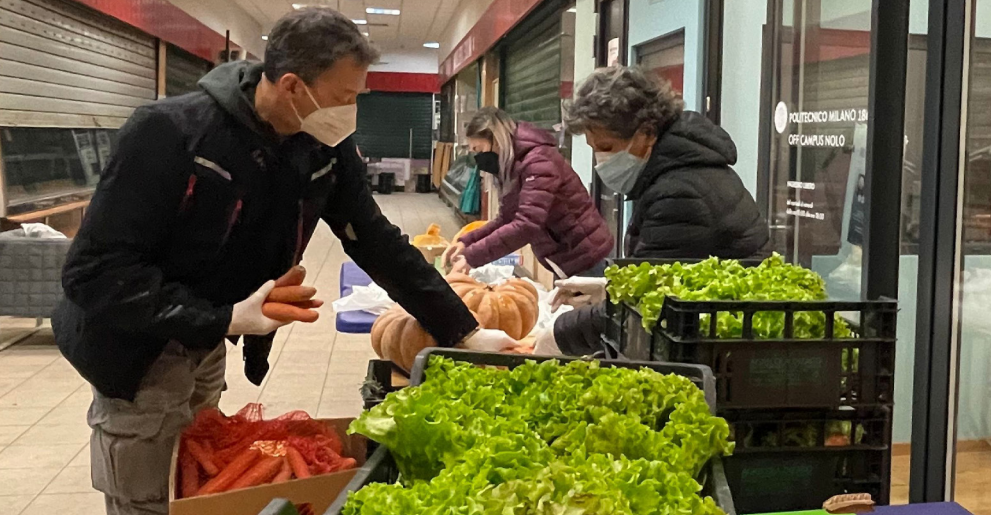
05. Volunteers during the preparation of food boxes, 2020

of the lockdown in June 2020, the project was paused. In September 2020, with the opening of the Off Campus Nolo space, lecturers and researchers from the Polimi DESIS Lab offered to host the service in their premises, taking on the project with the support of the Radio Nolo association. In March 2022, Spesa Sospesa Nolo became SOSpesa, thanks to the research project of the same name funded by the Polisocial Award.